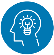
Strategy & Governance