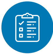
Policy & Organisation