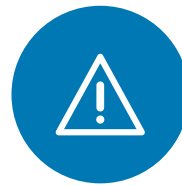
Threat & Vulnerability Management